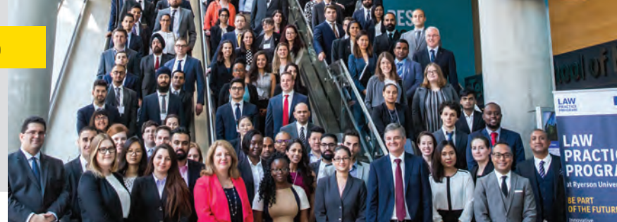
2017/2018 LPP Candidates

to our work placement employers, our strategic partner, the Ontario Bar Association and The Law Society of Ontario.