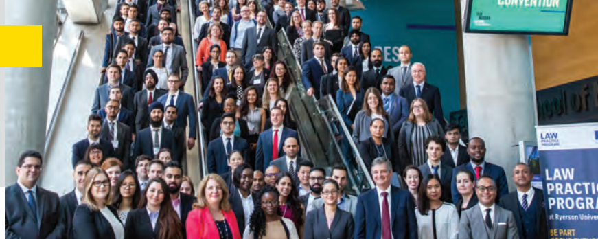
2017/2018 LPP Candidates

to our mentors, assessors, curriculum developers, guest speakers, the Ontario Bar Association for our strategic alliance, and The Law Society of Ontario.